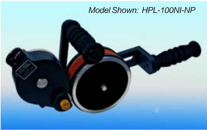
Model Shown: HPL-100NI-NP

Precision machined from aircraft grade aluminum alloy, these coders are ideal for printing specifications, lot numbers, date codes or product identification information on any flat, non-porous surface. The high quality impressions are both weather proof and fade resistant and can be applied at rates much faster than stenciling or conventional hand stamping.